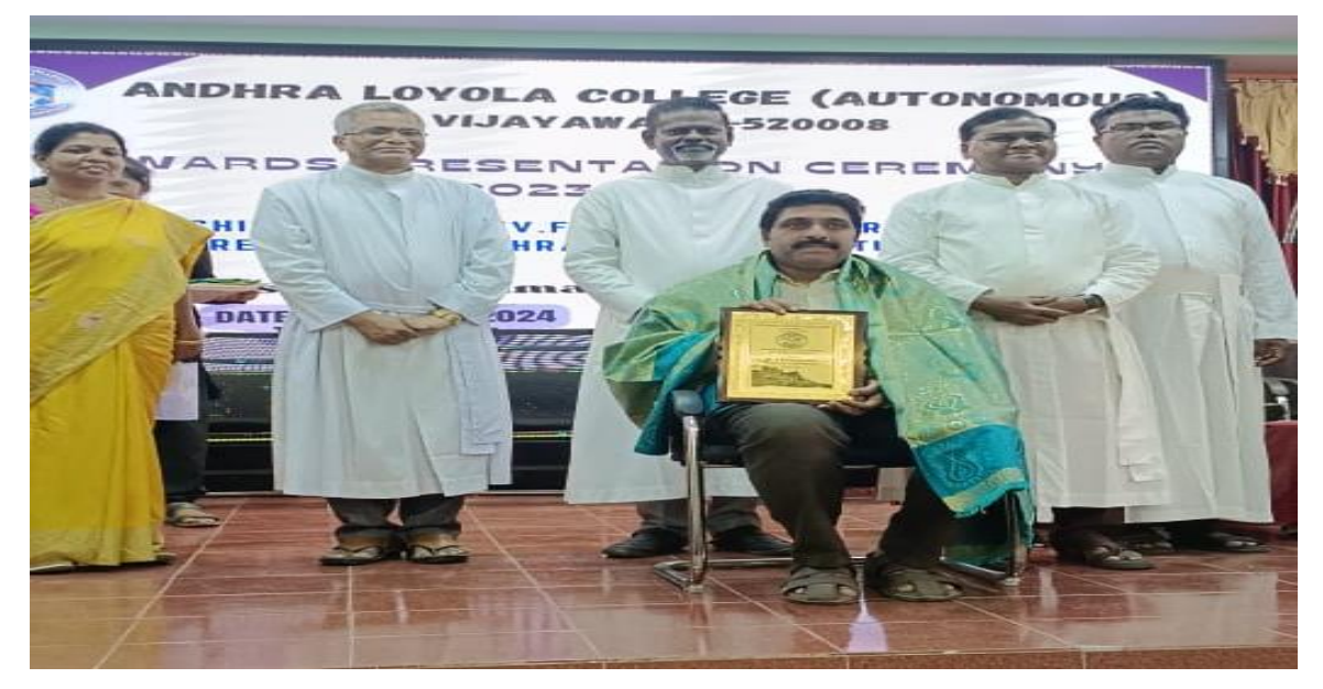
FELICITAION BY MANAGEMENT FOR Ph.D achievement