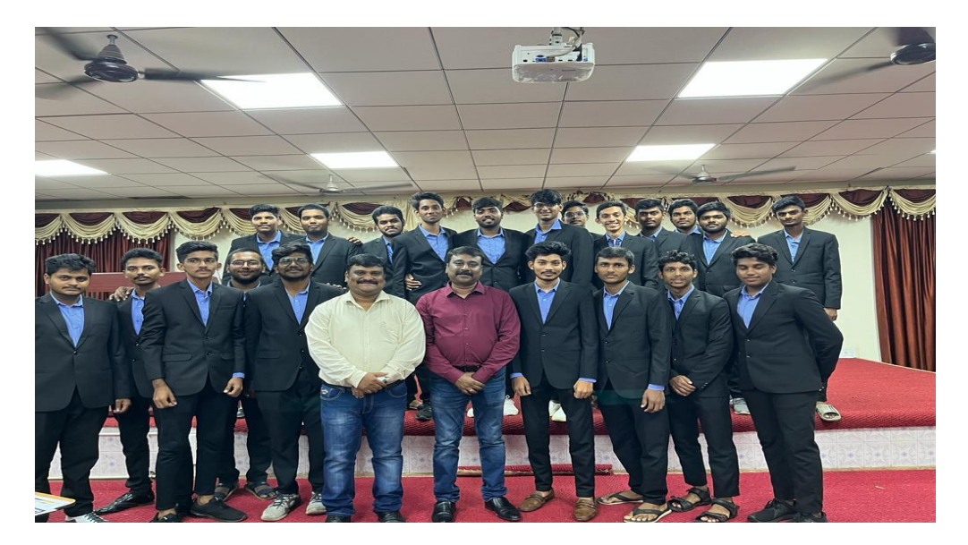
IBM Certification to the students on June 27^{th} 2022