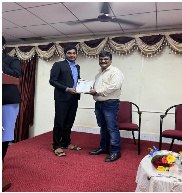
IBM Certification to the students on June 27<sup>th</sup> 2022