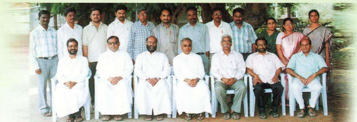
DEPARTMENT OF CHEMISTRY