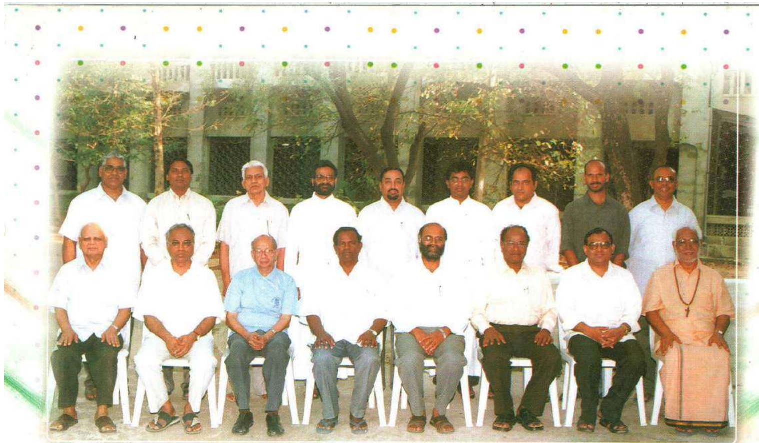
JESUIT FATHERS OF ALC