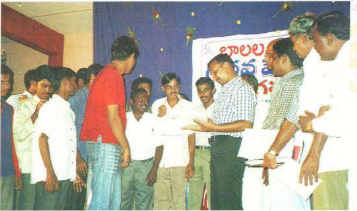
District collector appreciates the Loyola NSS