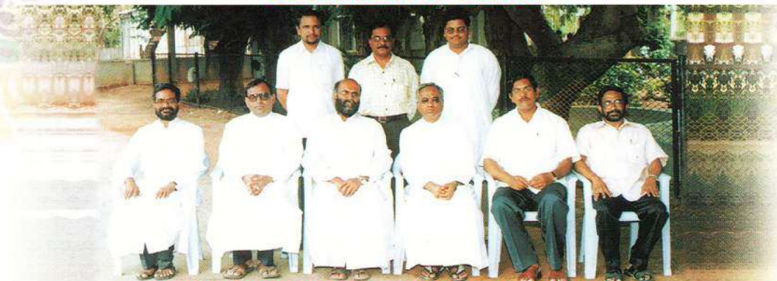
DEPARTMENTS OF HINDI & SANSKRIT