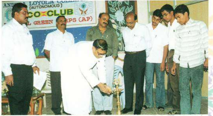
Inauguration of NGC