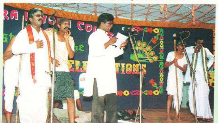
Creating a casteless society