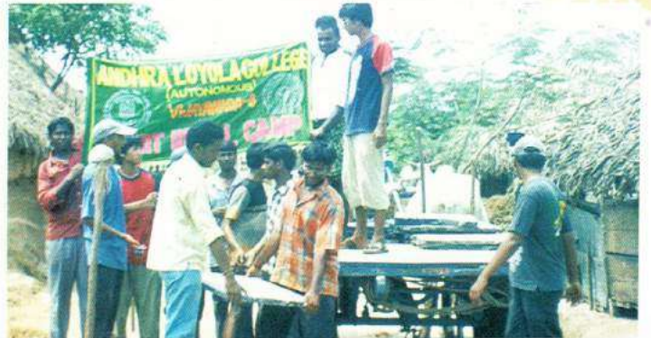
Muscle power or knowledge power