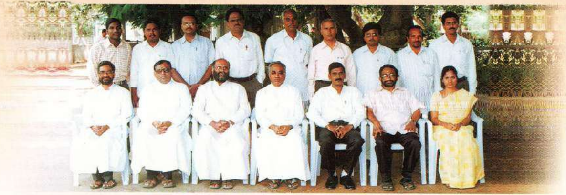
DEPARTMENT OF MATHEMATICS