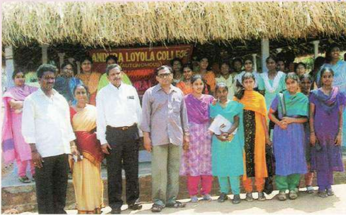
All set to go !