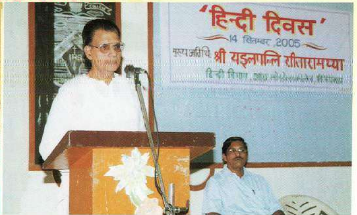
Hindi Day Celebrations