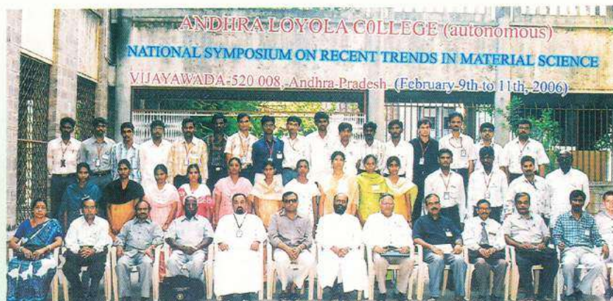
M.Sc. Physics Symposium