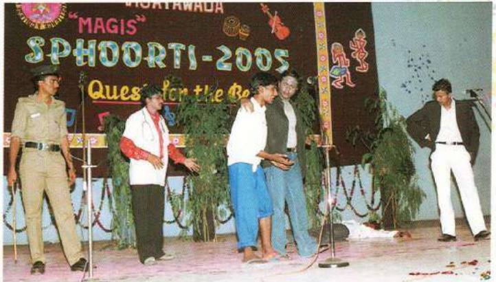
Getting the message across