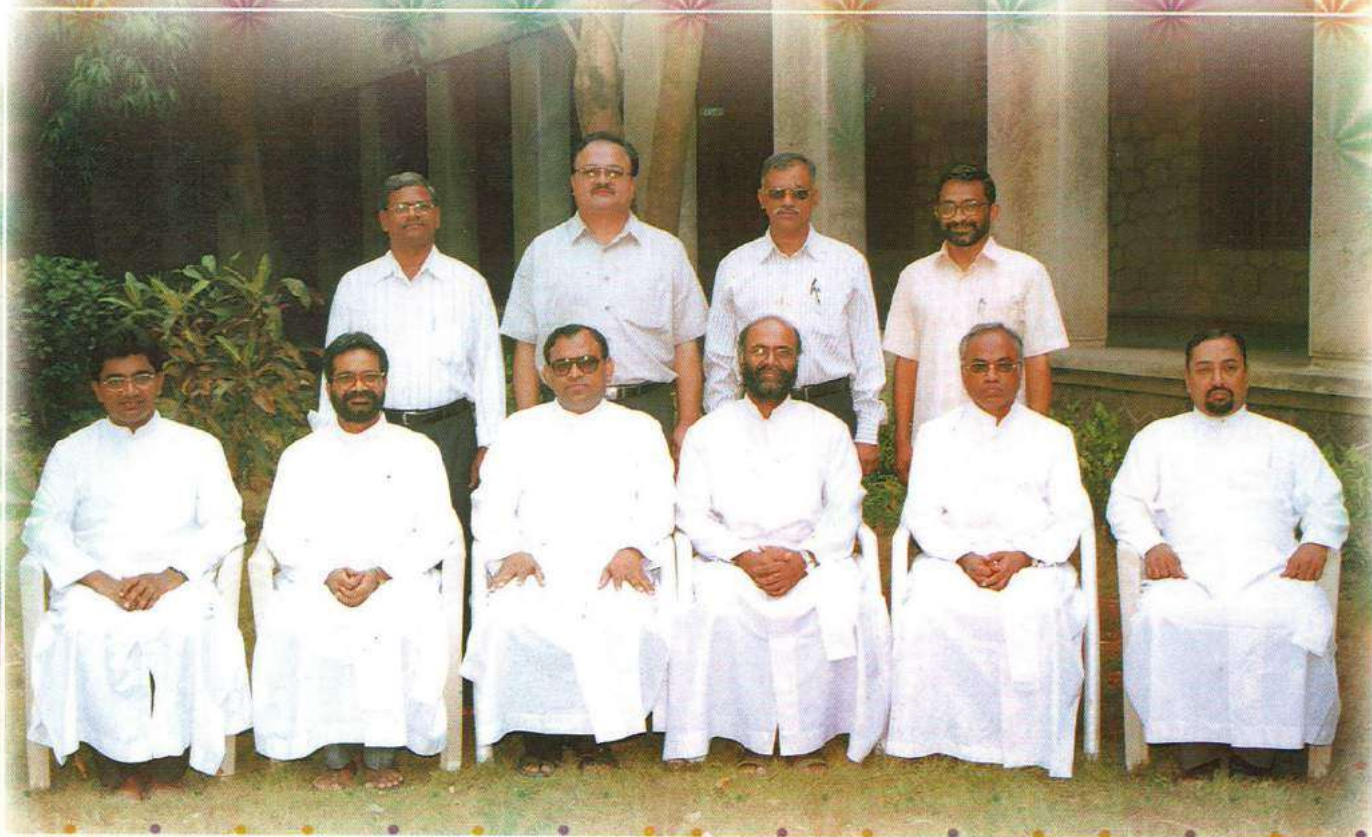
ADMINISTRATIVE SENATE 2005 - 06