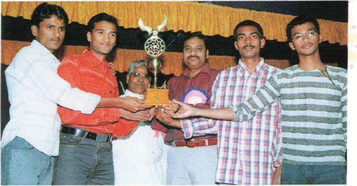
Xavier Hostel Day