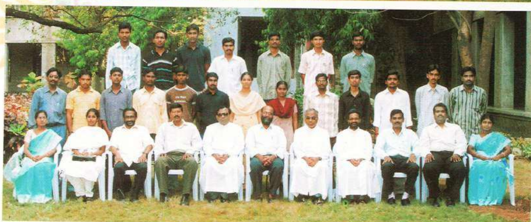
Electronics Computers & Maths (DEC)