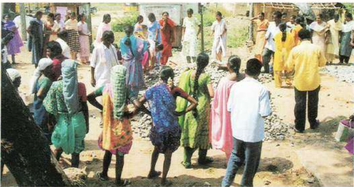
Pooling our resources with the local people