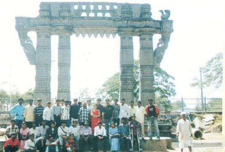
Visit to the historical monument