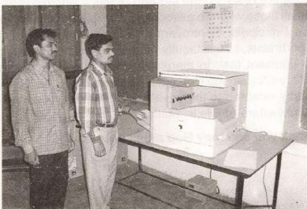
Reprography room: all the offices are connected to this printer