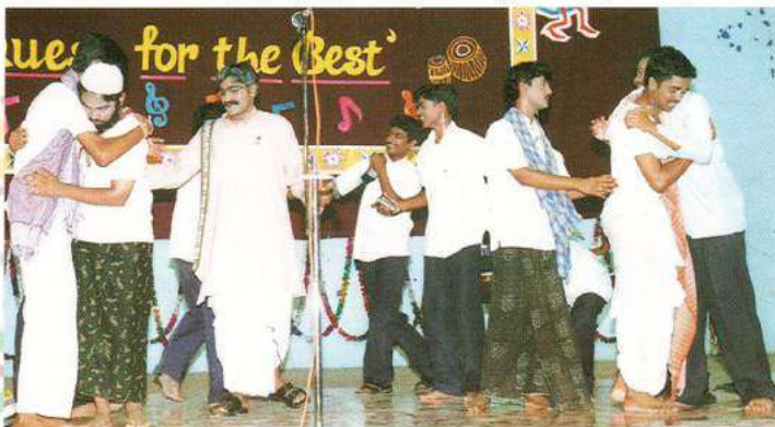
Students exhibiting their histrionic Skills