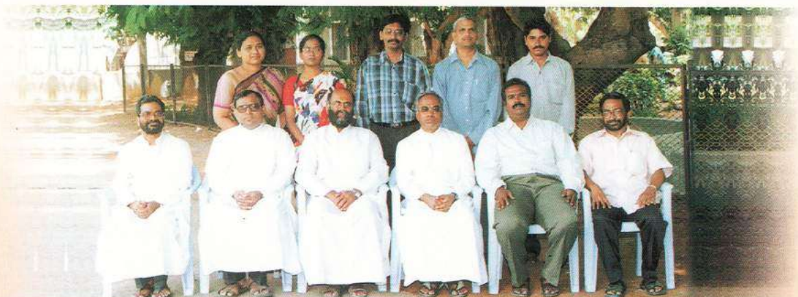
DEPARTMENT OF COMPUTERS AND VISUAL COMMUNICATION