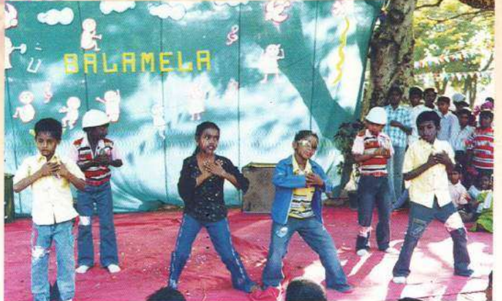
Bala Mela by Sanjeevanites