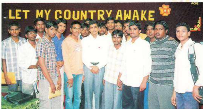
Mr. Jaya Prakash Narayan of Lok Satta, an inspiration to the Students