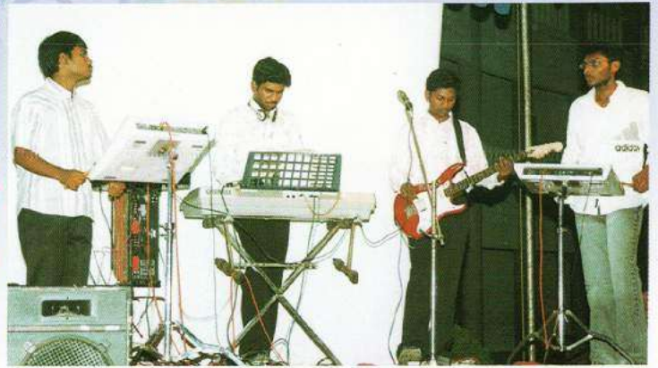
"Loyola Strings" takes wings