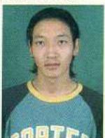
Chemi Yundung Football