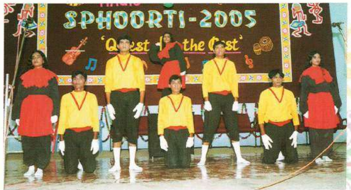
A.N.R. College Students performing mime