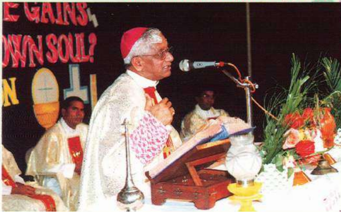
Our bishop building up the faith of our catholic students