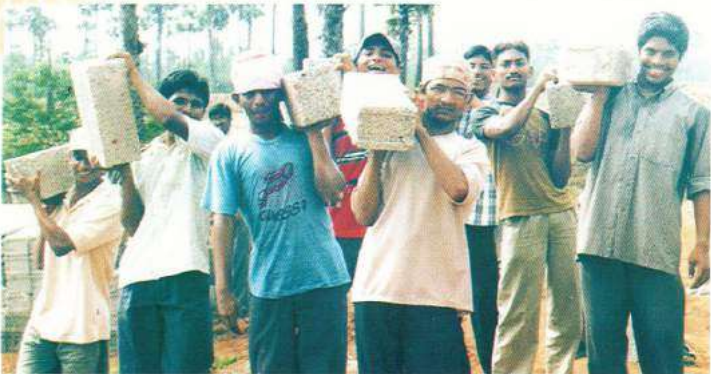
In the remote Tsunami villages