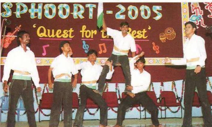
Action song extolling patriotism