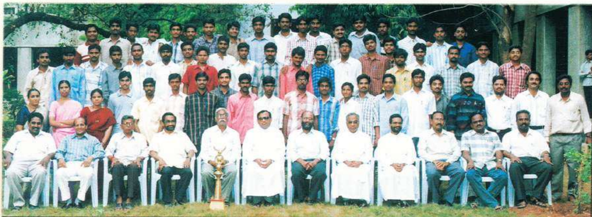
Maths, Physics & Chemistry (DC)