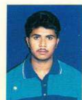
Jilani Patan Athletic, State-Gold Discus Throw