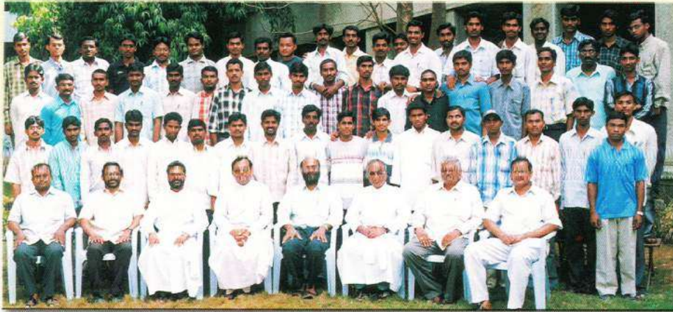
Arts III B.A.