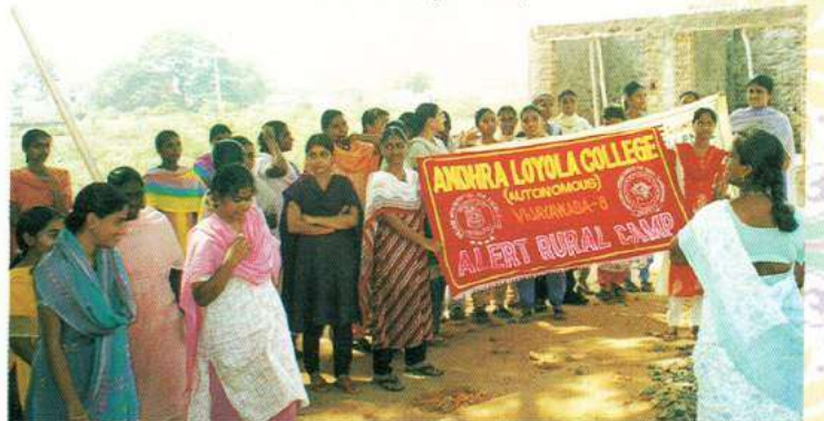
Community service gives meaning to our education