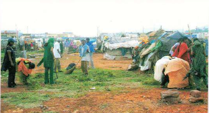
So, this is how a stum looks ! - a new experience the NSS Girls unit