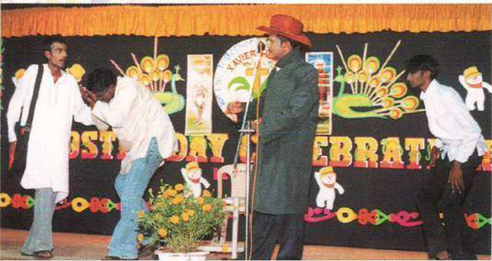
Skit by the Xavierites