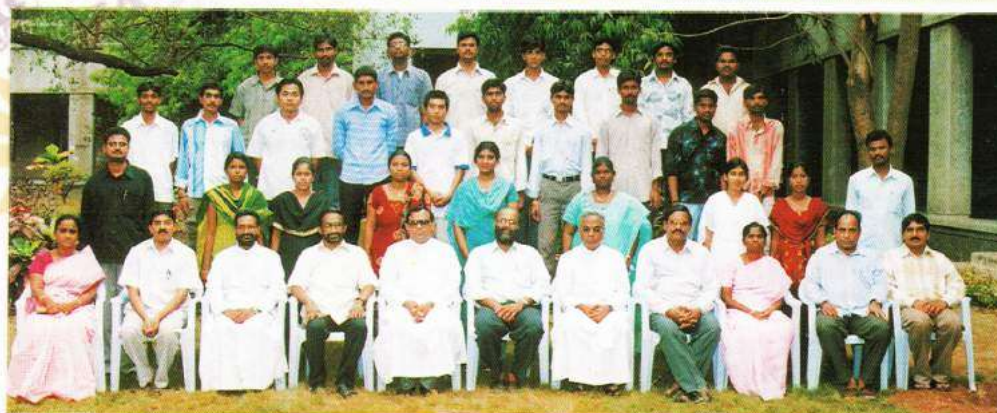
Micro - biology (DBM)