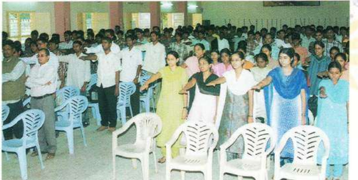
Eco Club under NGC taking oath