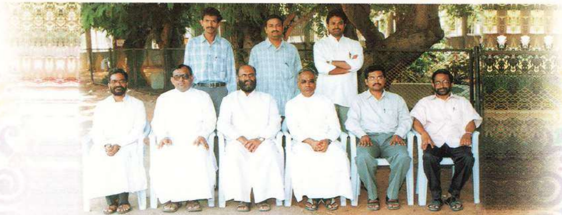
DEPARTMENT OF STATISTICS