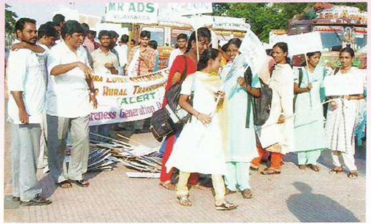
March for a better life