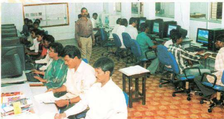
E-Learning in the Library