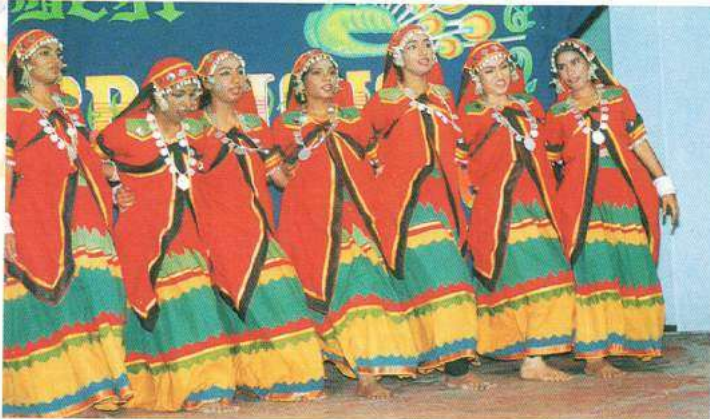
Colorful Lambadi Dance - A feast to the eyes by Degree girls