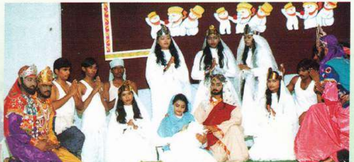
"Live crib of ALC"