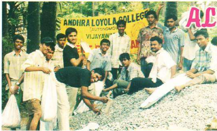
"We will not forget this exposure"