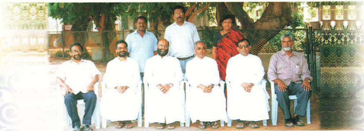
DEPARTMENT OF FOUNDATION COURSES