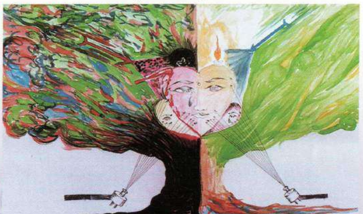
A work of art is a joy for ever