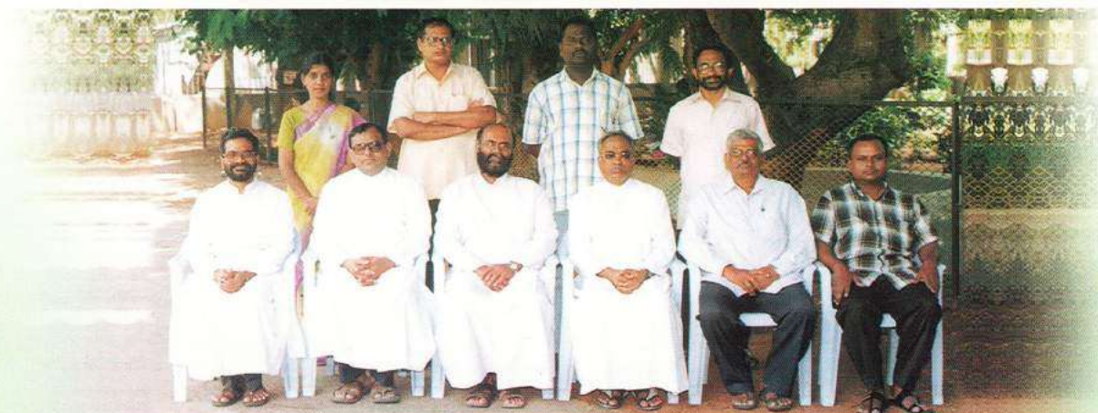
DEPARTMENTS OF HISTORY, POLITICAL SCIENCE & ECONOMICS