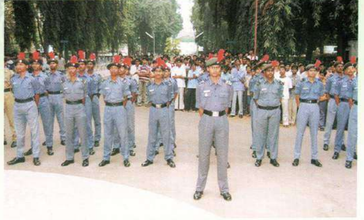
Proud to be a NCC Cadet !