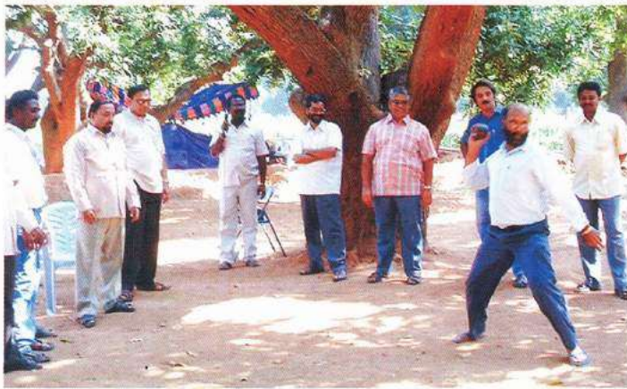
Staff garden party