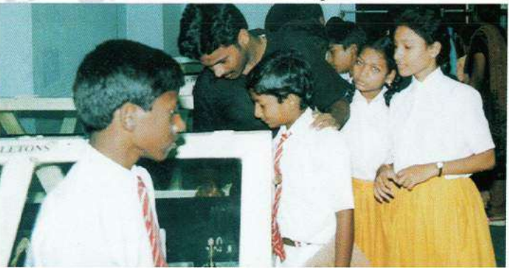
Taking the schools to our labs