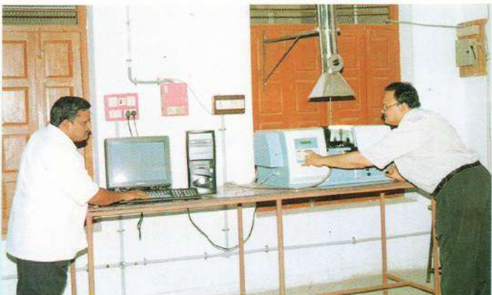
Inter - disciplinary Research Lab