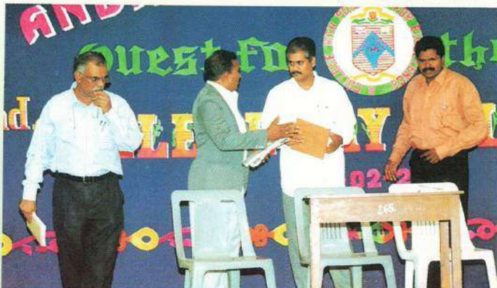
Skit by the Staff