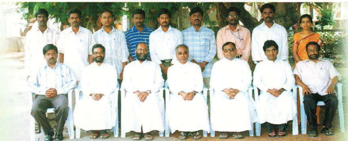
DEPARTMENTS OF ZOOLOGY/BIOTECHNOLOGY