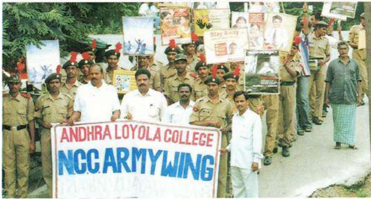
AIDS awareness March