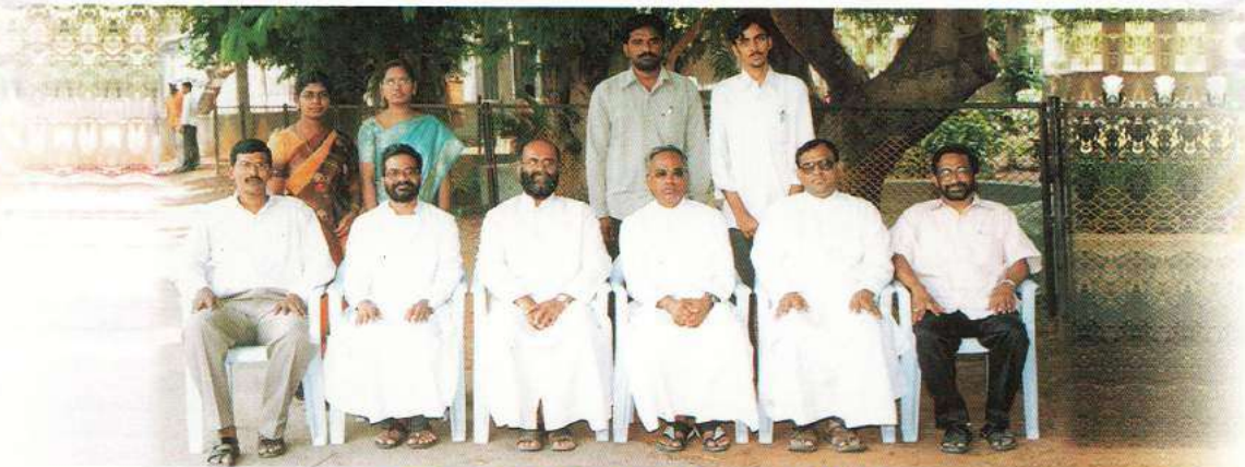
DEPARTMENT OF ELECTRONICS