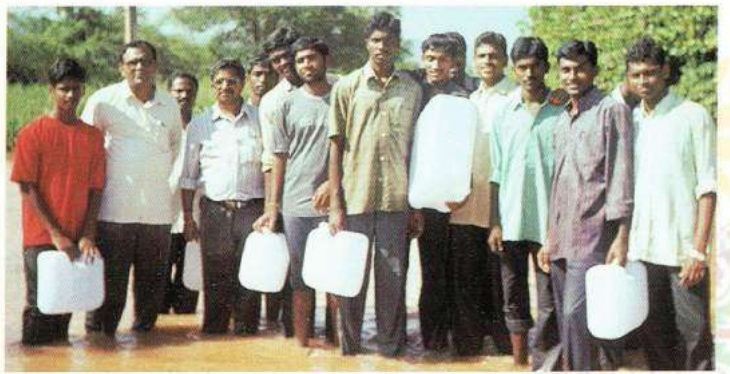
Rushing to the rescue of the Carmel Nagar flood victims