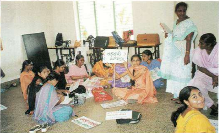
A lot of preparation before hitting the road.