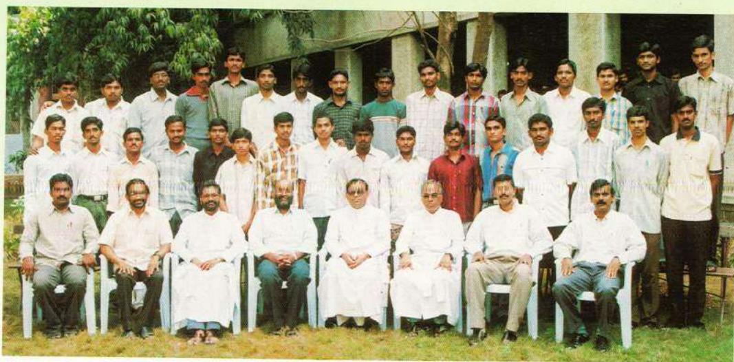
Electronics Physics & Maths (DEP)