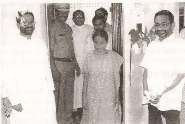
Lift for the Challenged