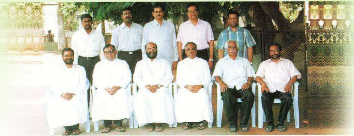
DEPARTMENT OF COMMERCE