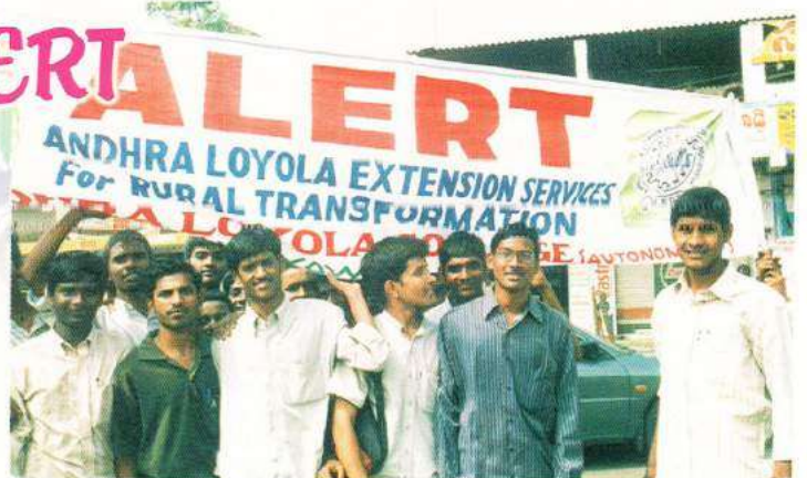
All set for 3 days camp