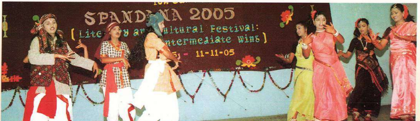
Dance ballet by the Inter students