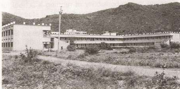
New Intermediate Block

The Department of Physics has started a Computers Simulation Laboratory for the first time in AP at undergraduate level in the academic year 2005-06. The Simulation Laboratory is equipped with six computers where the B.Sc., Physics students will do simulation experiments. A number of software packages for these simulation experiments are available. The topics include Mechanics, Optics, Thermodynamics, Electricity and Electronics. The department is planning to offer these simulation experiments as elective practical for III B.Sc. students. Using Macromedia Flash, a number of simulation experiments like springs, Pendulum, Newton's rings etc. are developed and about 150 animations and simulation experiments are collected (downloaded). Circuit maker, a free software available on internet is useful to do all the electronics experiments of B.Sc., students (Practical IV)