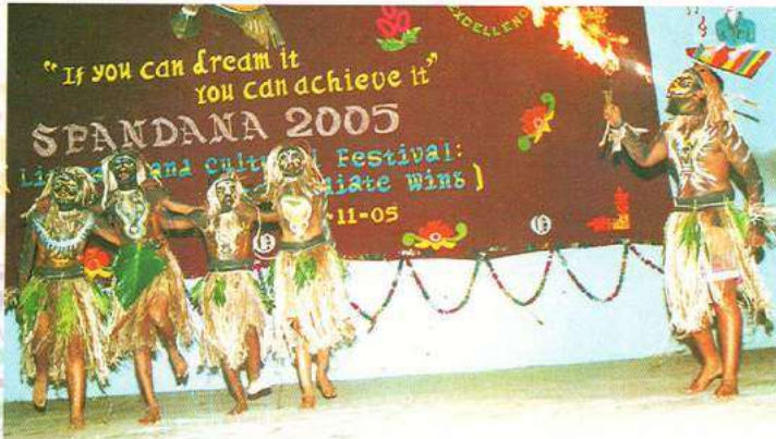
Spandana - A roit of colors