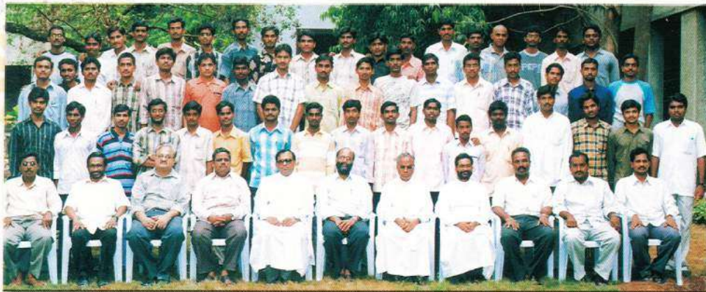
Maths Chemistry & Physics (DP)