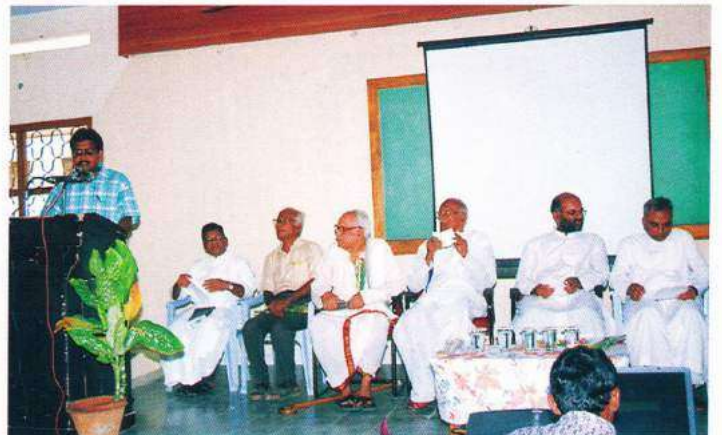
Honouring the retired staff