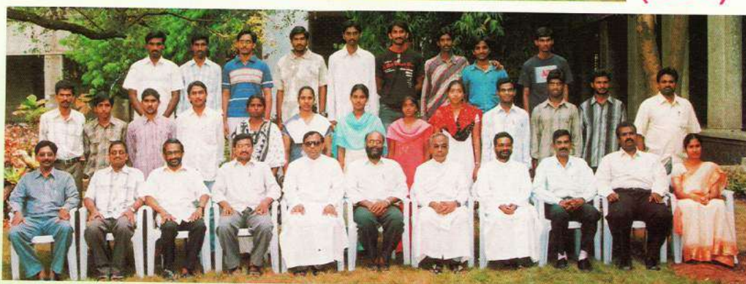
Computers Maths & Statistics (DSC)