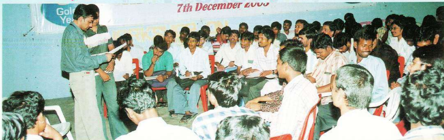
Orientation to Career Choices for all Final Year Students