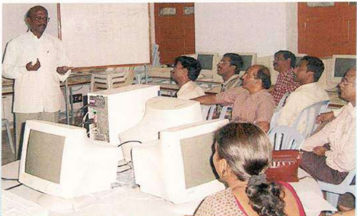
Training of Teachers in Multimedia Production