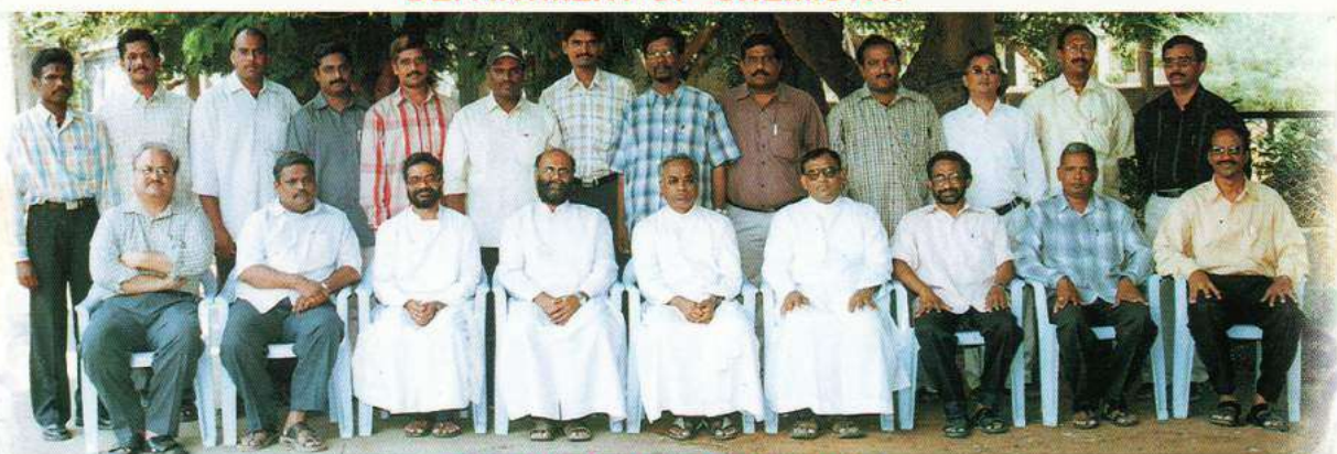
DEPARTMENT OF PHYSICS