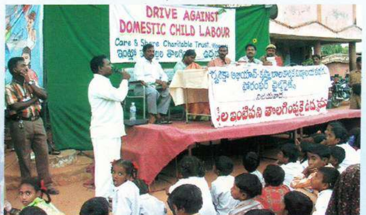
Drive against child labour