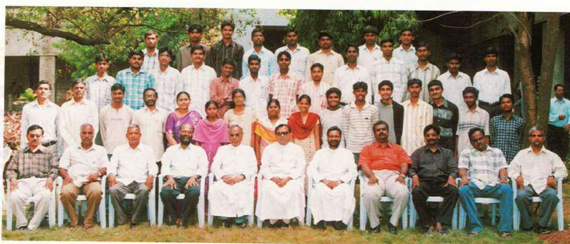
Computer Physics & Maths (DCP)