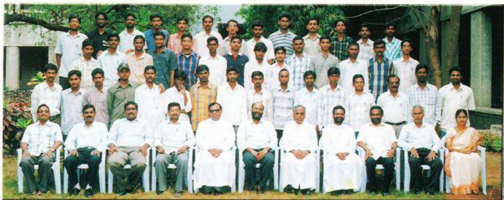
Maths & Statistics (DML)