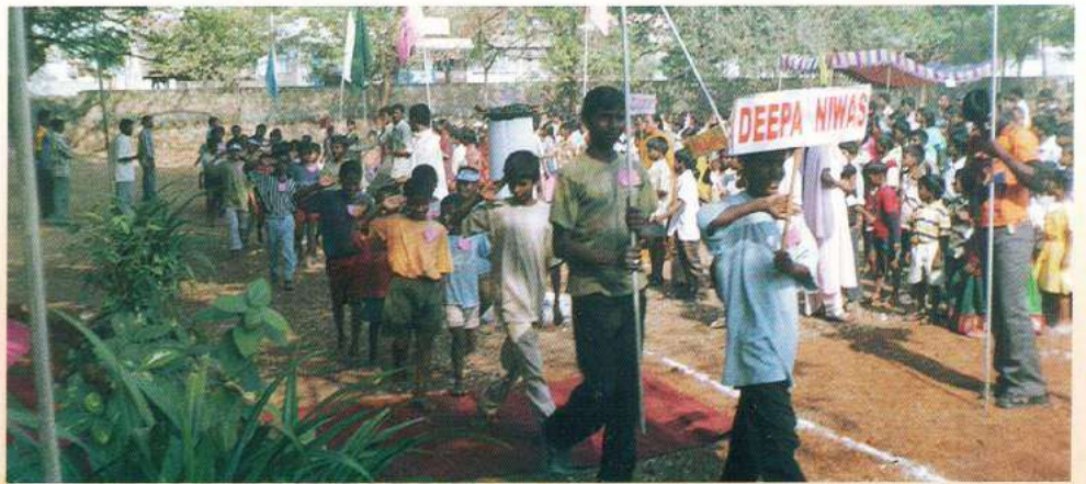
Sharing a day with the stret children