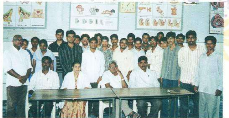
Zoology Students at the Medical College