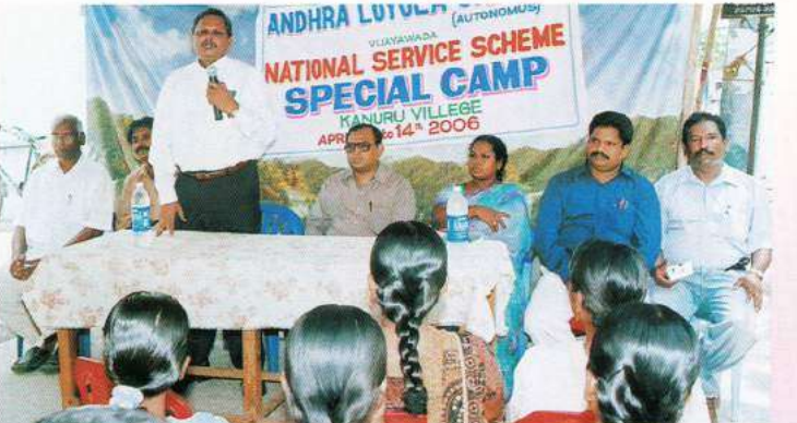
Well done NSS volunteers of Loyola