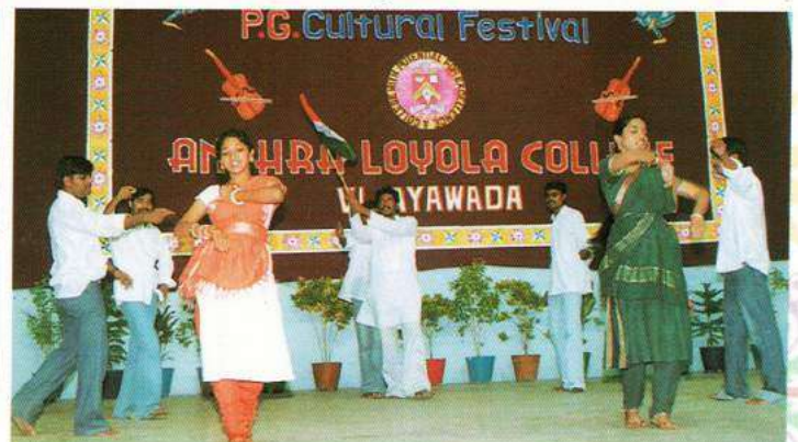
PG Students enthraling the audience