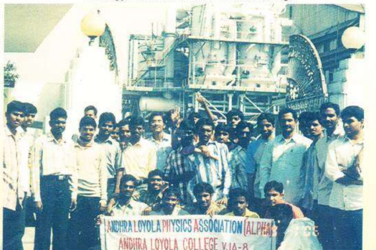
Physics association at an industry