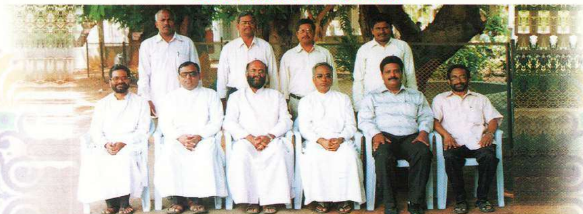
DEPARTMENT OF TELUGU