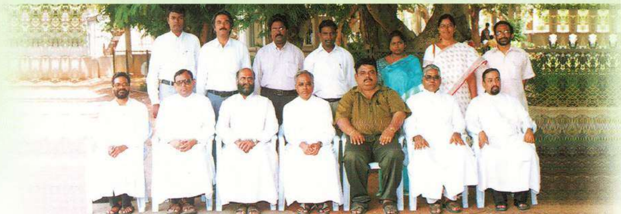
DEPARTMENT OF ENGLISH