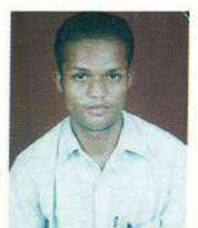
University Level Football Player