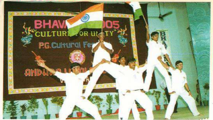
I love my India