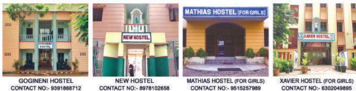
GOGINENI HOSTEL CONTACT NO:- 9391868712