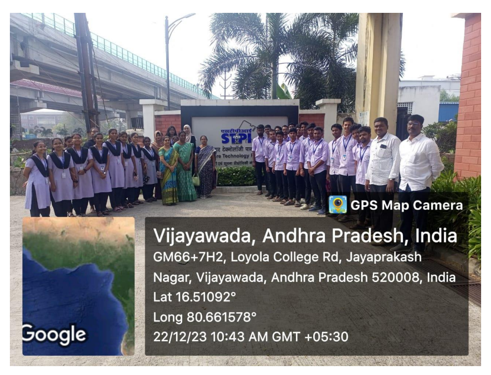
04-Sep-2023 Master of Computer Application(MCA)