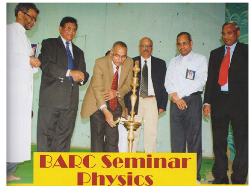
BARC Seminar Physics