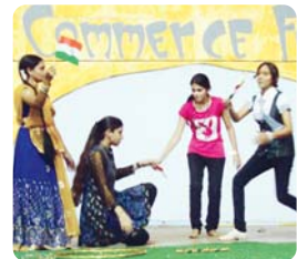
Bemus 2010 Page 5