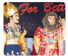
Sphoorthi 2010 Page 6