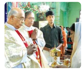
Feast of St Ignatius Page 11