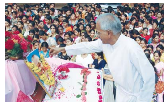
ALC remembers Dr YSR Page 14