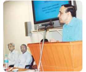
BEC workshop Page 3